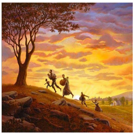
Escape at Sunset